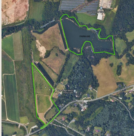
Plumlea Farm ~200 acres