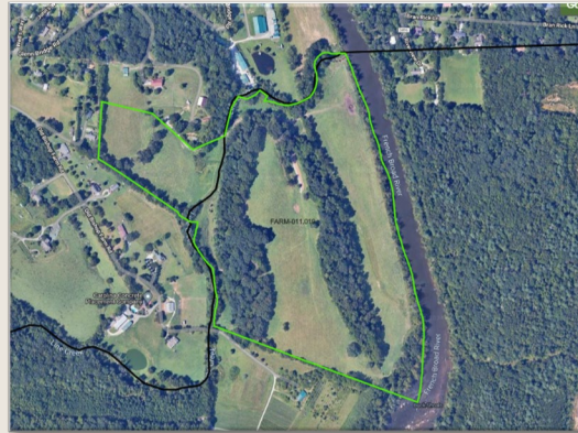
Brown Farm ~70 acres