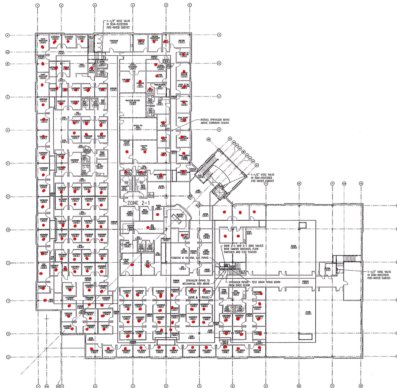
FIRE PROTECTION PLAN - SECOND FLOOR