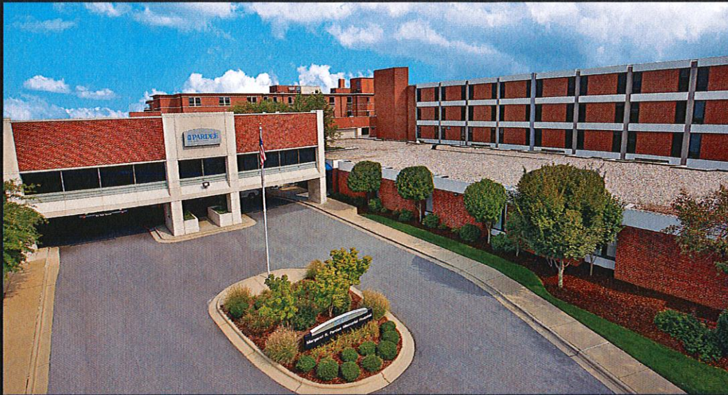
Medical Office Buildings