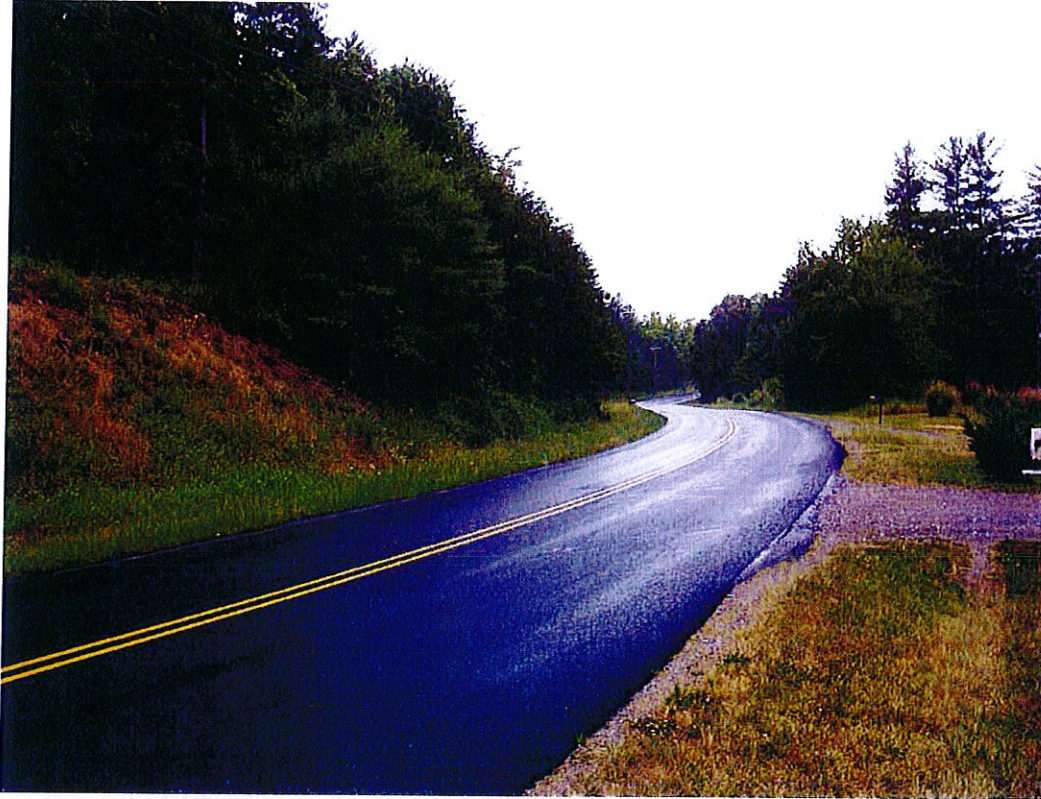
Looking North into property along Clear Creek Rd