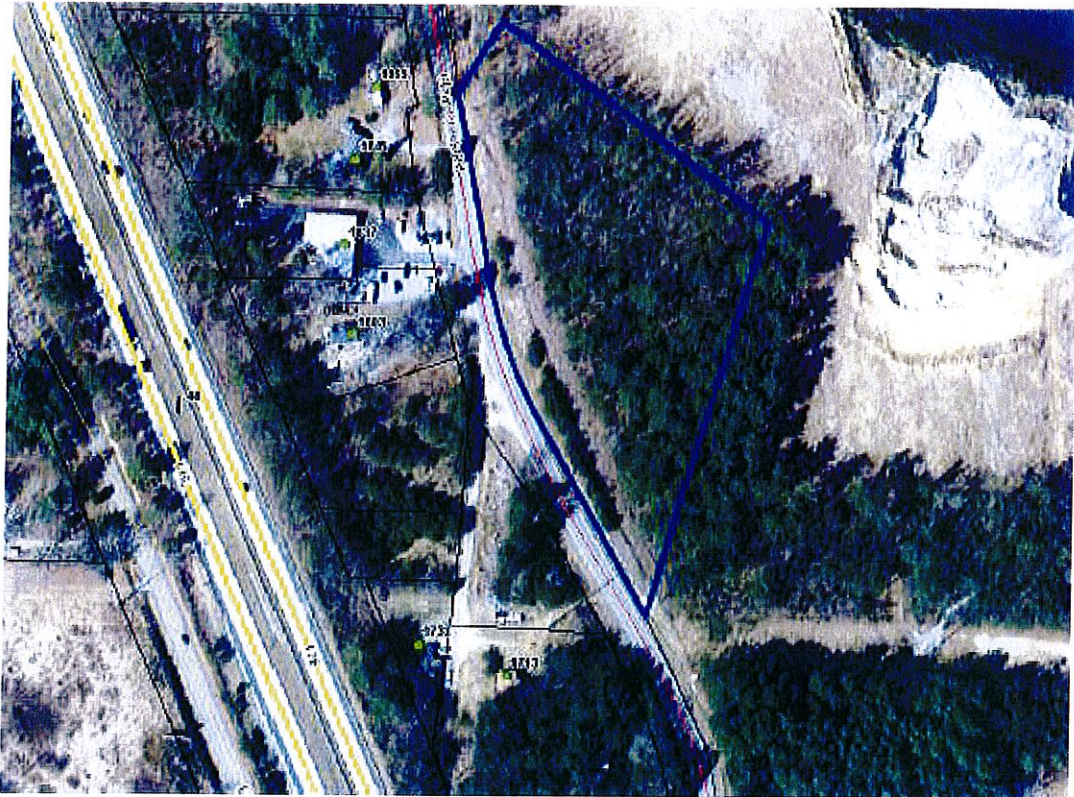
Map A: Aerial Photo/Pictometry