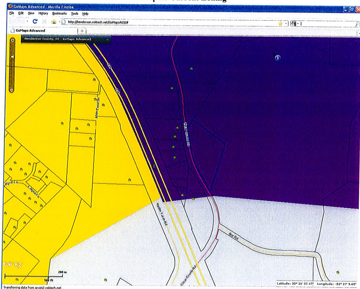
Map B: Current Zoning

2.4 Floodplain /Watershed Protection The property is not located in a Special Flood Hazard Area. The property is not in a Water Supply Watershed district.