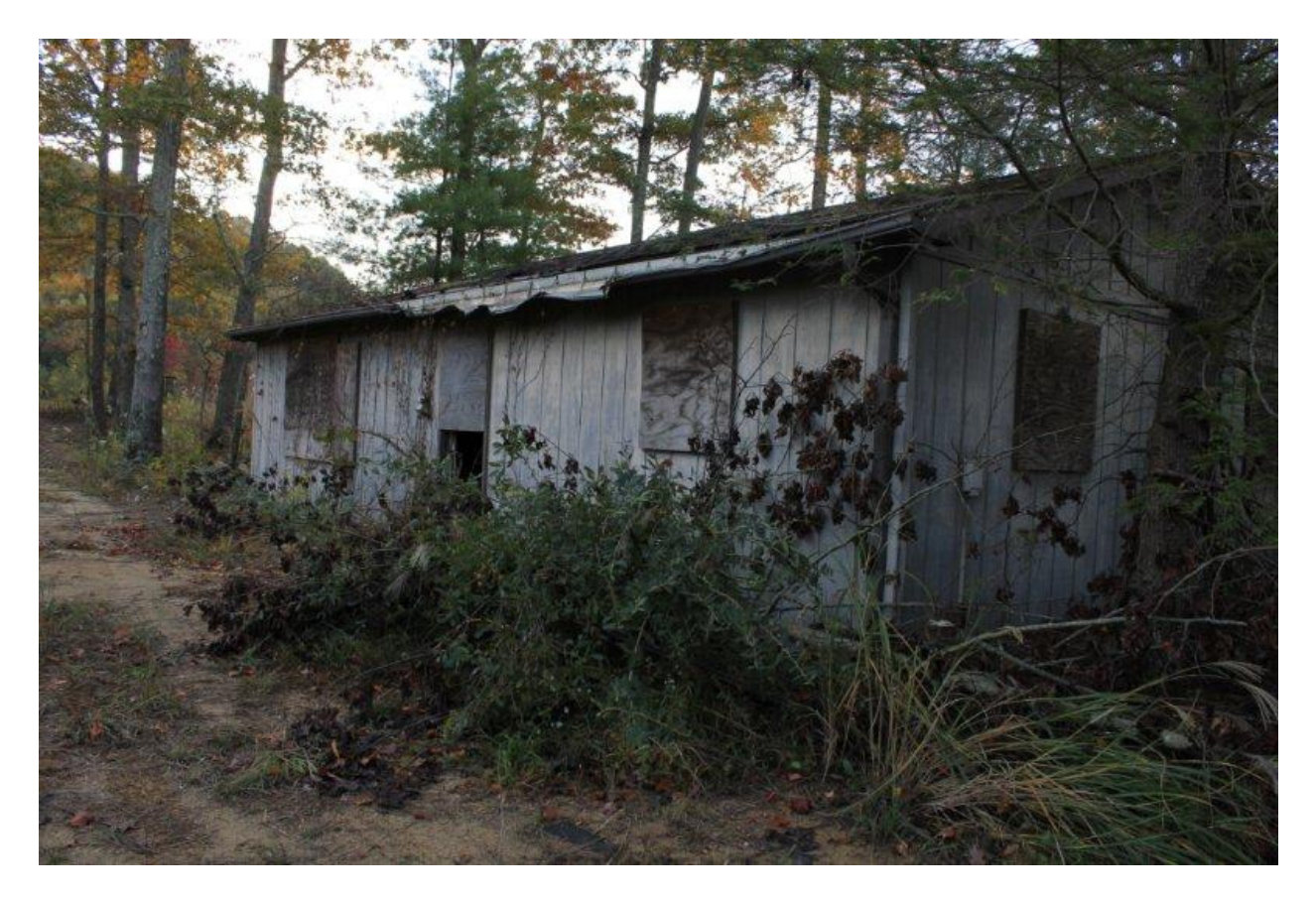
Location of Buildings