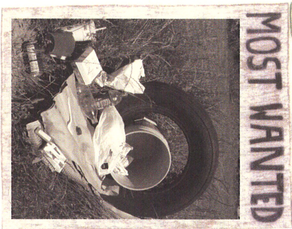
Can you find the 10 most often retrieved items during the Big Sweep cleanups in this picture? Look inside to find out what the 10 items are!