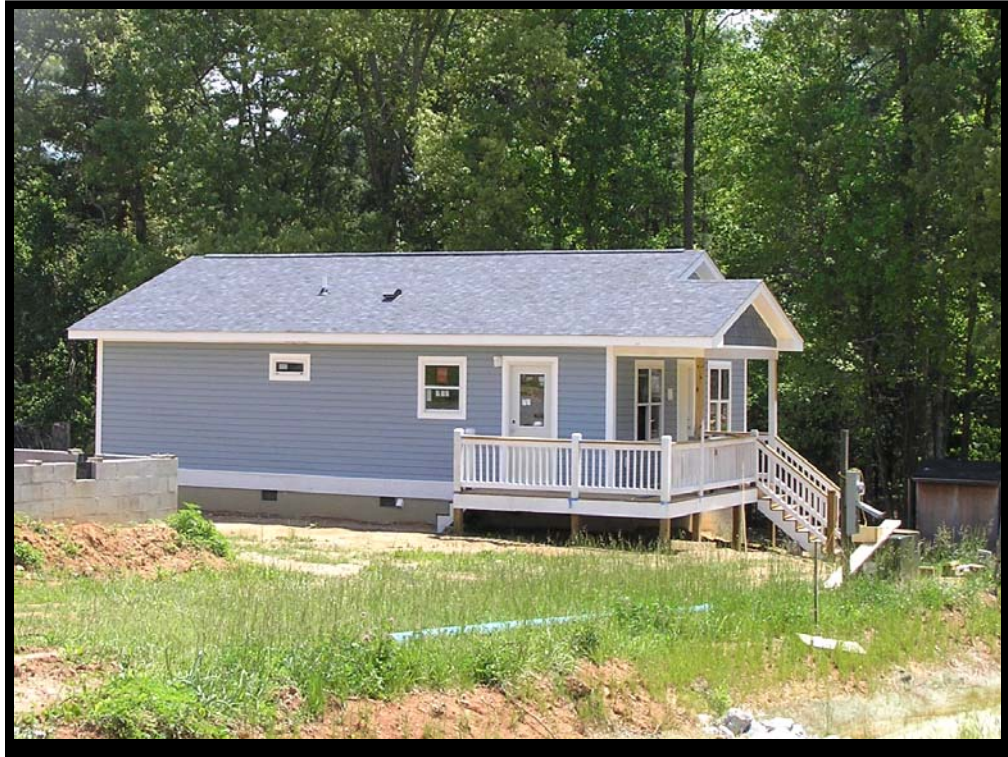
This home, recently constructed, illustrates a typical home in Shuey Knolls.