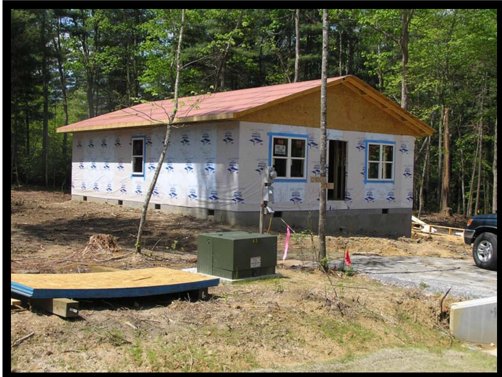
This is a picture of a new phase three home under construction.