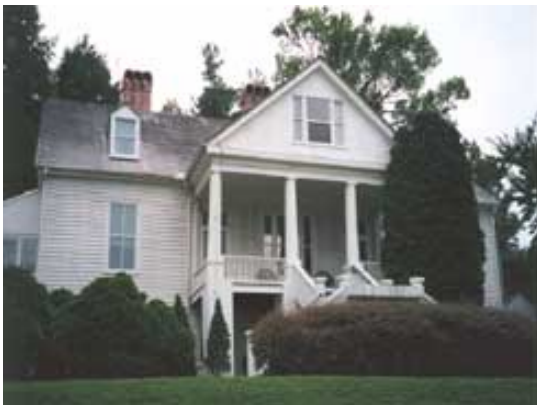
Carl Sandburg Home – National Historic Site