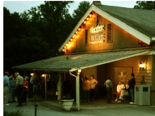
Flat Rock Playhouse – Flat Rock Historic District