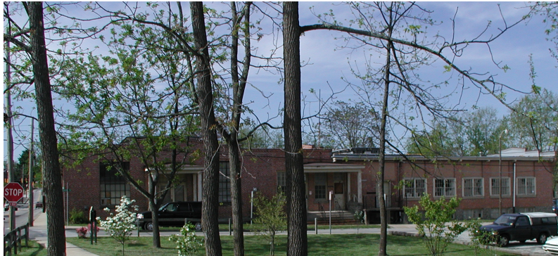
Historic Grey Hosiery Mill (Proposed Location for Mill Center)

For details regarding all the selected heritage tourism development initiatives – See Section Two.