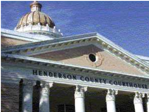
Historic Henderson County Courthouse

Several key heritage sites have been factored into this plan to capitalize on the growing heritage tourism industry and the popularity of our area. Among them: