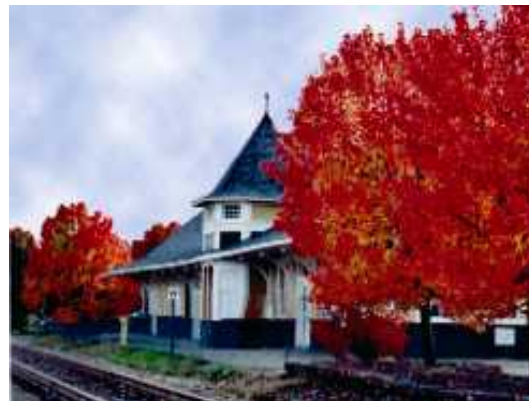
Seventh Avenue Railway Depot